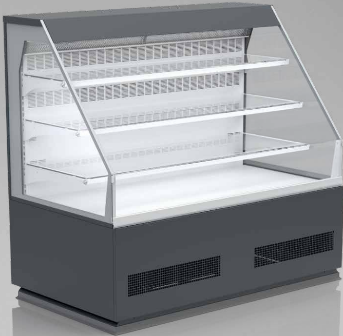
Elegant RDEL-22 1400 BSA

BSA – low glass or front glass riser | single, straight | fixed