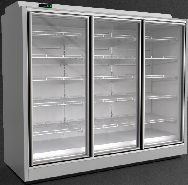
Glacier SNGL-L3 2342 DTO